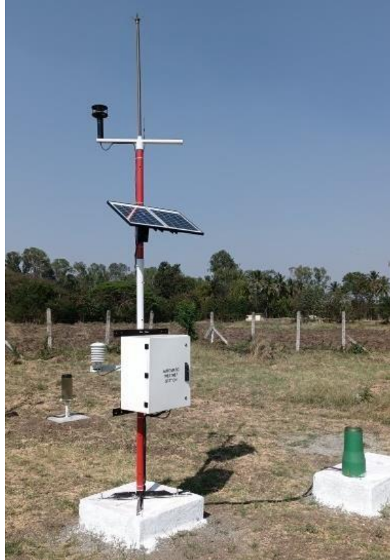
Figure 7: Reference standard AWS