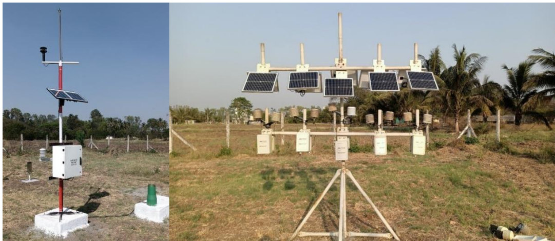
Figure 8: Sensors collocated with Reference Grade AWS for field calibration and comparison on field