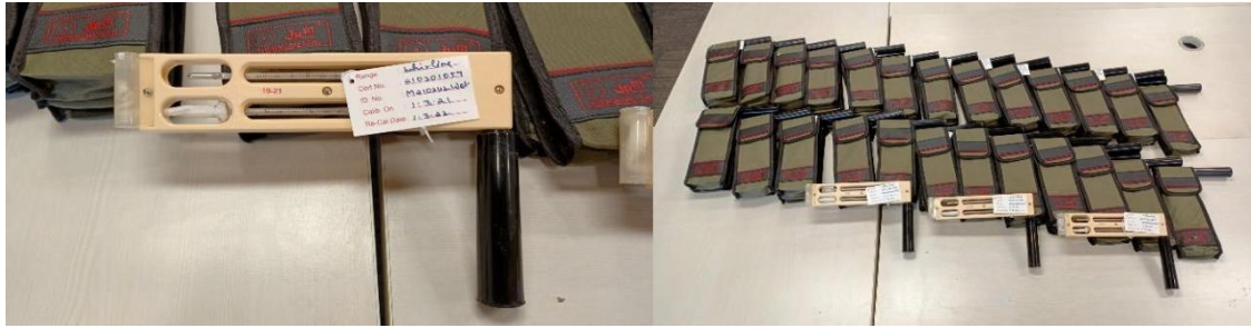
Figure 10: Reference Travelling Standard Whirling Psychrometer.